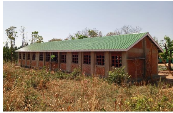
Construction of CRB