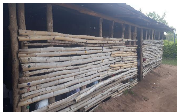
Temporary classrooms built by the current headteacher in late 2022