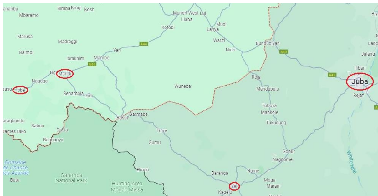
AR focus areas: Ibba, Maridi and Yei