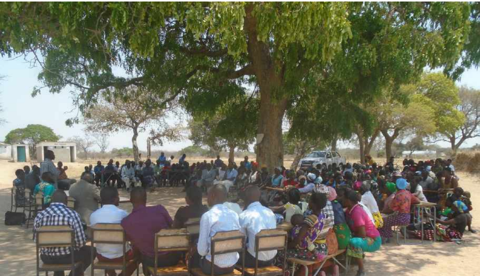
Nazilongo Community Meeting to plan for labour and material contribution

The school is now able to maintain sanitation with enhanced facilities, which will improve attendance of teachers and pupils.