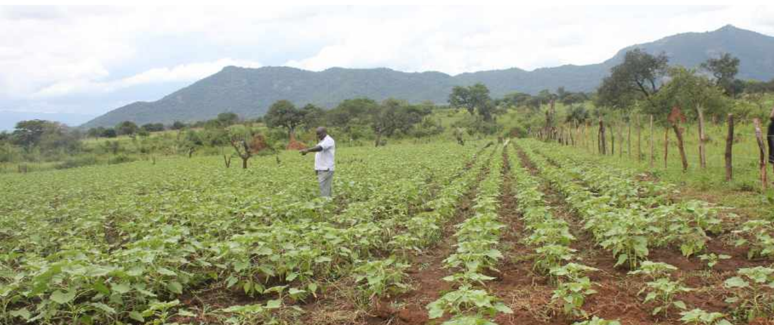
A school Demonstration Farm, Lamwo, Uganda