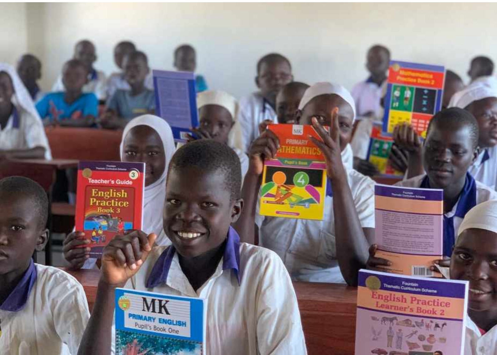
Students at a Koboko District Primary School constructed by AR

With the continued assistance of our donors and partners, to whom we are deeply grateful, we look forward in the coming year to helping all the communities we support in Uganda, Zambia and South Sudan to consolidate on their existing progress or to establish a firm basis upon which they can make similar progress.