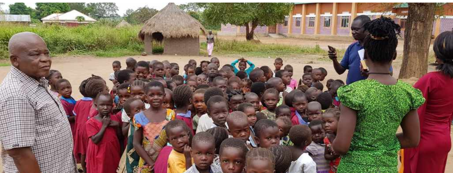
Students at St. Barnabas with their temporary classroom behind them

Yei: In Yei we supported 4 schools with teachers' salary top ups and stationary for pupils through The Brickworks. Schools supported included Lizira secondary school, where we have previously built a classroom block.