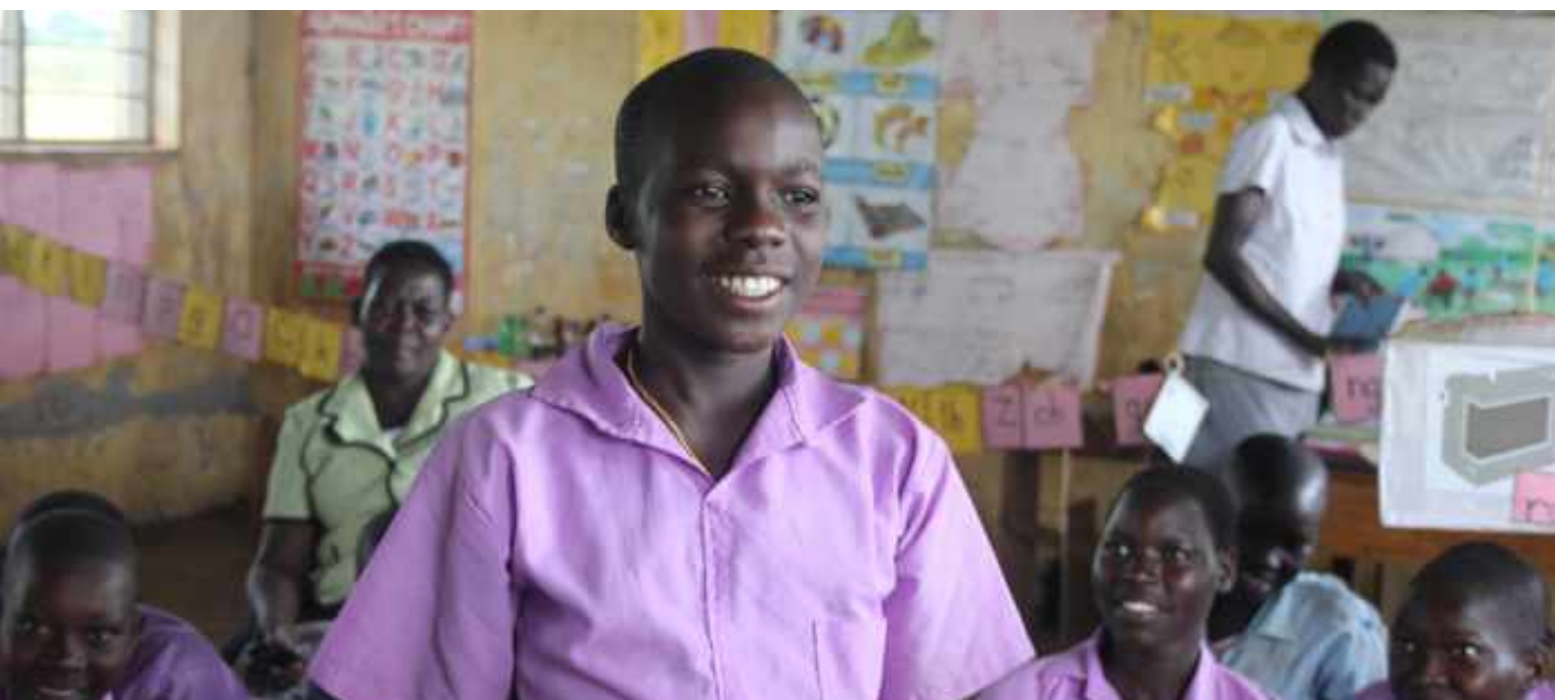
MHM workshop - Girls and Sanitation

Girls and Sanitation: 702 girls were supported in 2019 with pads, which allowed us to test if just training had an impact in the Amuru District, enrolment data was delayed as the education sector moved to an electronic system. 46 teachers were trained to support girls properly after grant duration and manuals were distributed to all target schools. 6,609 pupils received MHM training (3,002F : 3,607M). 2,400 additional girls in Amuru District were supported with pads at the start of term in February 2020. As part of this project we secured funding from The British Foreign School Society to construct pupil and staff latrines at Palukere Primary School.