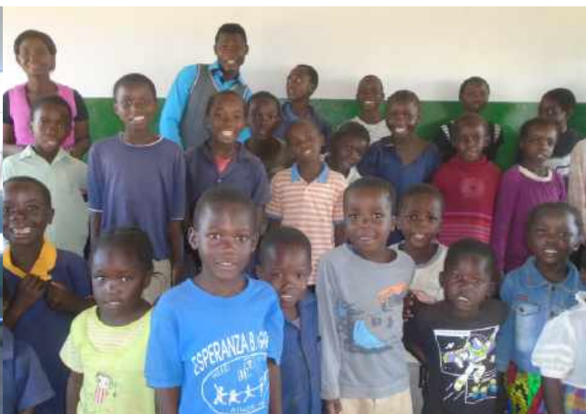
The New Classroom Block at Kansumo School, Supported by Play It Forward