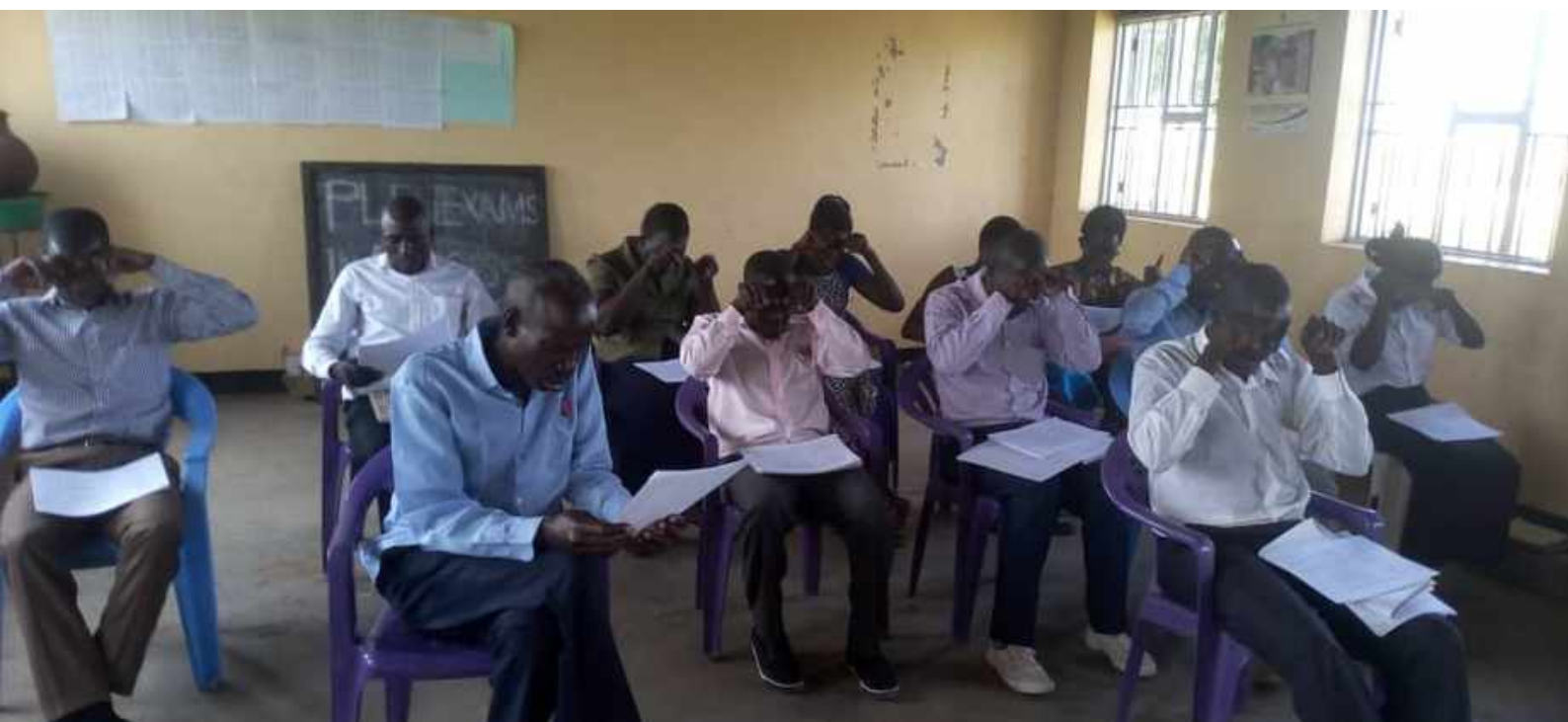
Phonics Teacher Training

Phonics Expansion: We continue our successful phonics expansion project at 20 schools in Nwoya and Amuru districts and will train approximately 200 teachers to use phonics methodology in the classroom. Individual support for teachers will ensure we build on the results achieved in the last round of the project which saw a 15.55% increase in literacy. This demonstrates the effectiveness of phonics based teaching within the curriculum.