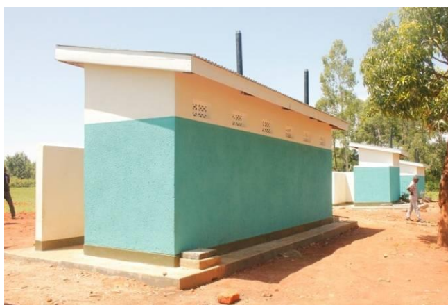
Row 1 (l-r): School children receiving visitors and Tony giving out balls to the student Row 2 (l-r): Handing over the keys Row 3 (l-r): view of the completed facilities at Oyiga Community primary school