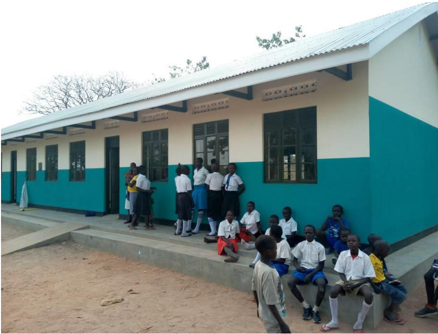
Students on the handover day at Nyakaliso School