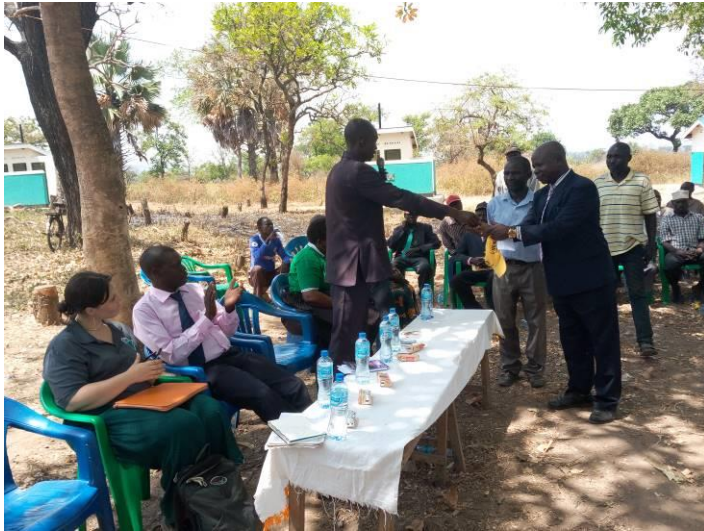
Chairperson SMC receiving keys from the Chairman Local Council V Koboko district of the new CRB block at Nyakaliso