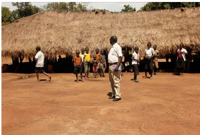
Aditiru Classrooms before