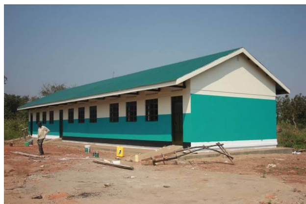
New CRB at final painting stage