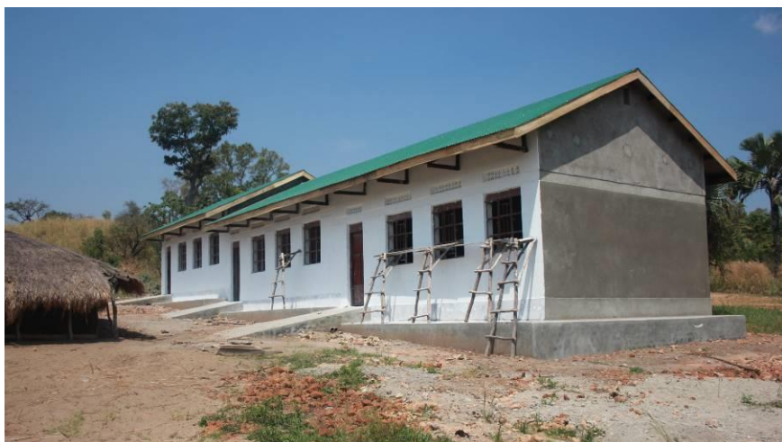
Classroom Block under construction