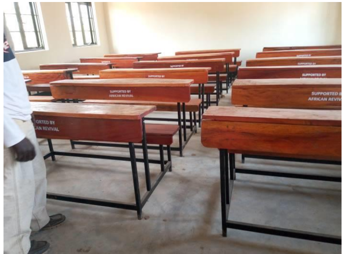
Wall plaque, furniture in the classroom and rear view of the new block