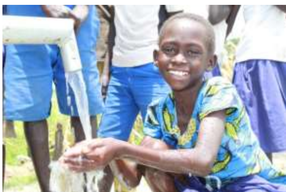
Students at Anyau school enjoying clean water for the first time.