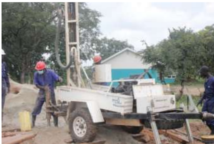
Nyakaliso Community Primary School.

Drilling eventually commenced in July 2019. We were successful at 2/3 sites but unfortunately at the third site (Oyiga) we did not find water – despite drilling 30 metres deeper than the survey indicated. This is sometimes the case in the Koboko District, where the hydrogeology is very complex. Additional costs were incurred from this dig. AR and Drop in The Bucket agreed to put in another borehole at a new school site, which was surveyed and drilled – Dricile Primary School. Here water was successfully found.