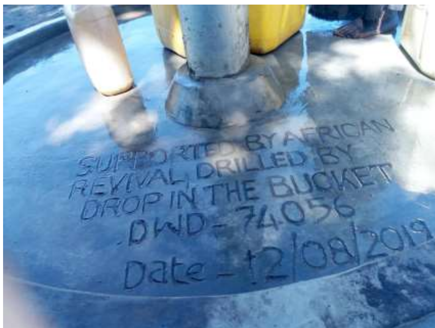
Inscription on the apron showing the key information.