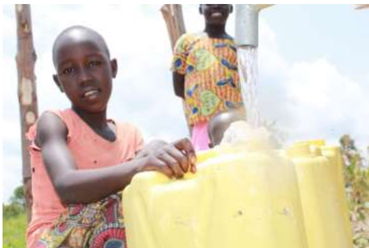
Members of the school community finally collecting water from the new borehole.