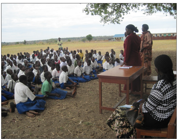
Girls workshop at Bwobo Manam

This project has been a great success – the girls are really proud to be a part of it and we are carefully monitoring attendance rates. We are now working hard to establish these girls' washrooms in five more schools in Uganda.