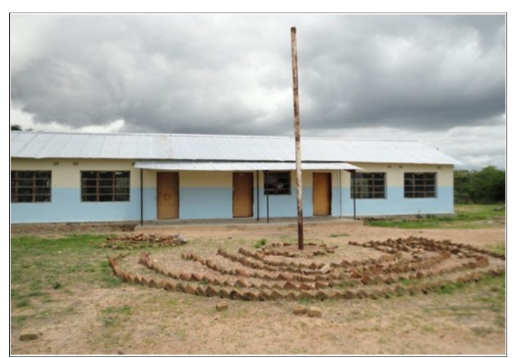
The new classroom block at Bowwood (Two teachers are currently living in this building)