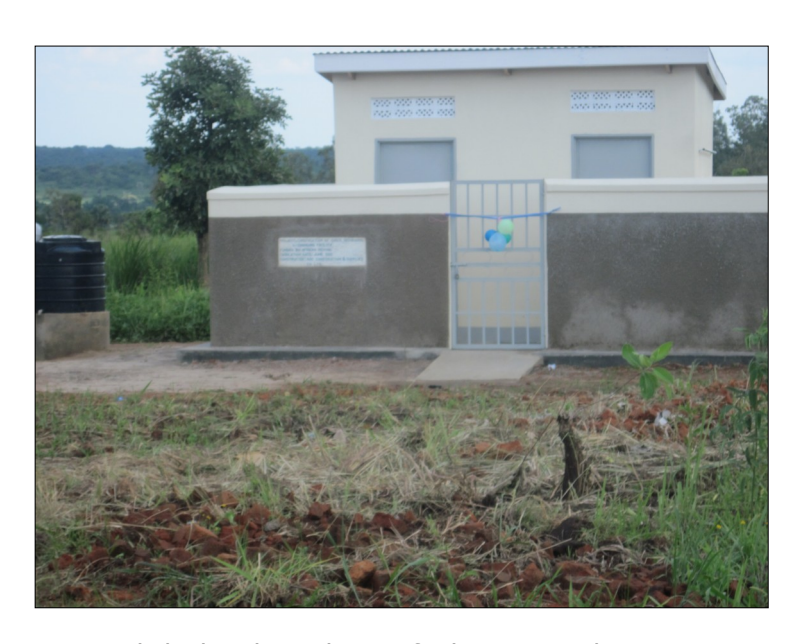
Newly built girls washroom facilities at Bwobo Manam