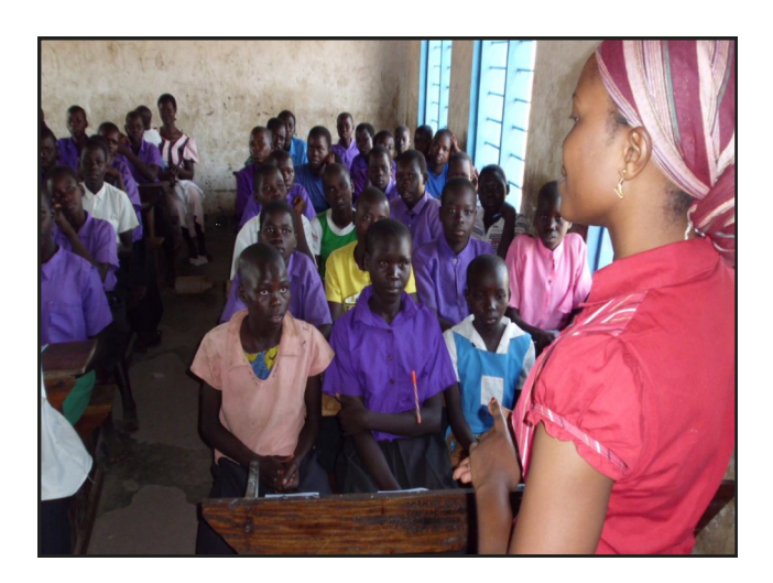
Girls attending a healthcare workshop

At Akanyo Primary School the girls changing and wash room facility is now built and being used. Trained facilitators held a workshop attended by 180 girls giving them guidance on the transformation that their bodies will go through once they enter puberty.