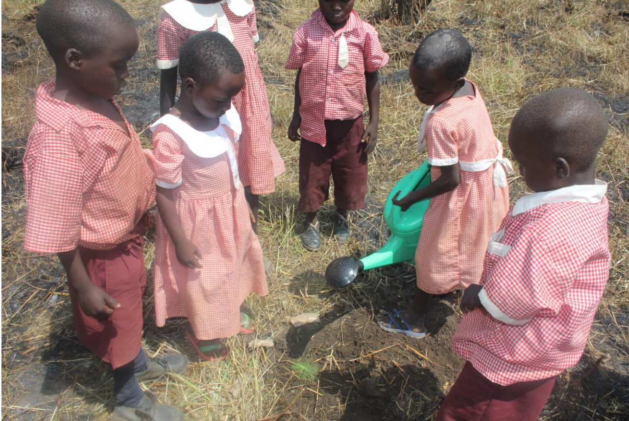
School Demonstration Farms