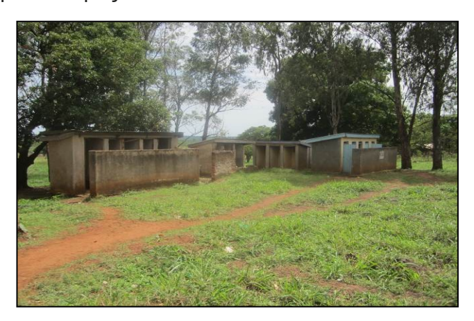
The dilapidated toilet block