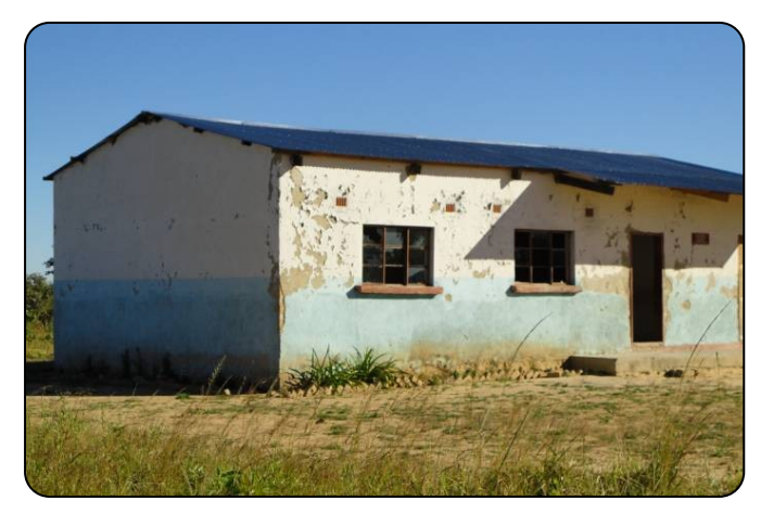
An existing double classroom block

With your help, we hope to start this work in early 2013.