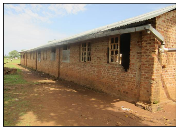
An existing classroom block

We'd also like to repair the borehole which will ensure access to safe and clean drinking water at the school, but also for the wider Anaka community. We hope these projects can start soon.