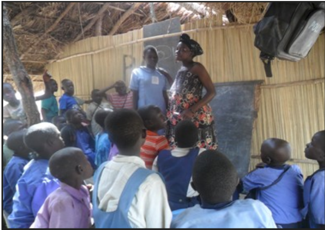
Children inside the classroom

In the coming months we want to build and equip a classroom block, drill a borehole and give them proper toilets.