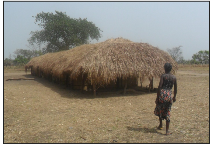
Grass thatched classroom