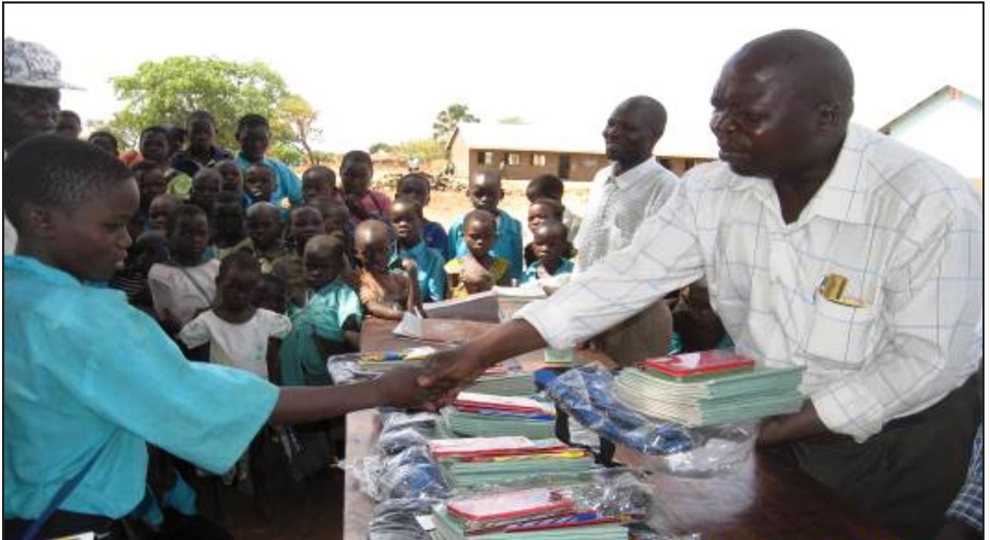
Children at Juba Road Primary School in Northern Uganda at their Certificate Award Day in May 2012