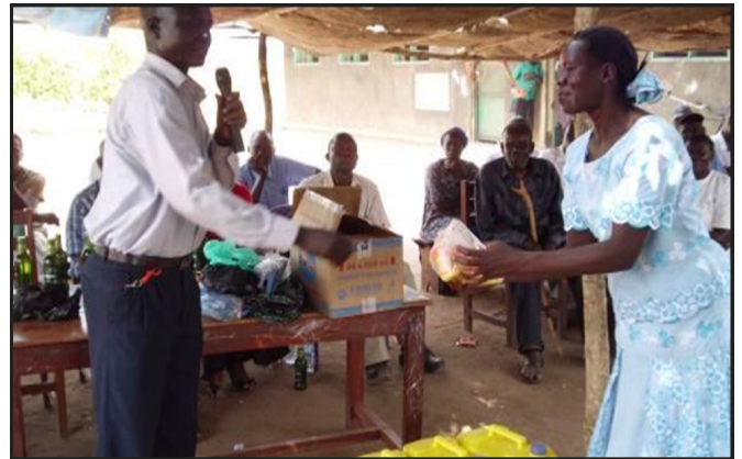
Girls receiving their AFRI-pads

For these reasons, we have started to construct simple girls changing and wash room facilities coupled with workshops from healthcare professionals, touching upon puberty, marriage and handling their monthly periods.