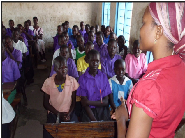
Girls attending a healthcare workshop

At Akanyo Primary School the girls changing and wash room facility is now built and being used. Trained facilitators held a workshop attended by 180 girls giving them guidance on the transformation that their bodies will go through once they enter puberty.