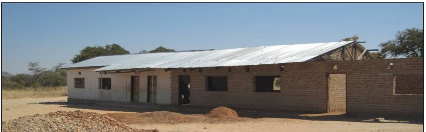
The only classroom block at Siamwaamvwa

With your help, we aim to support the school with functioning buildings, along with enough double-seater desks for everyone and provide teaching and learning materials. We also aim to construct a borehole to ensure the school has safe, reliable and clean water for drinking and hand washing.