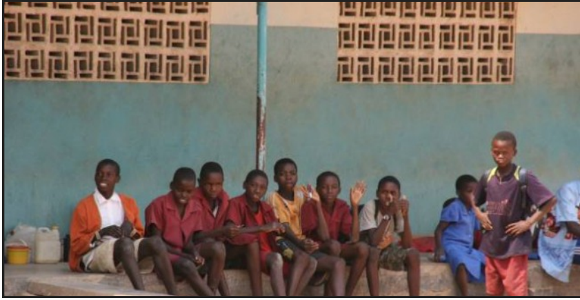
Pupils at Mulwazi Basic School

Our team in Africa are continually looking for new schools who are in need of help and here are details of a few of those in greatest need.