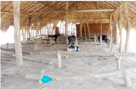
The unsuitable thatched classroom