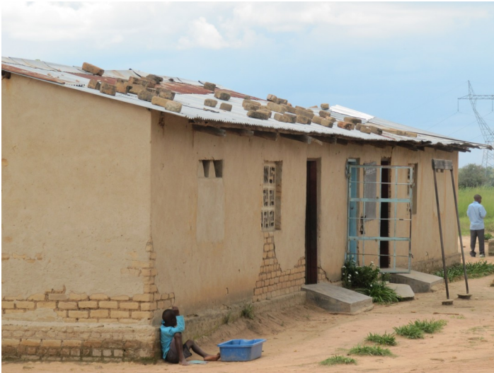
Kasizi Double classroom before renovation