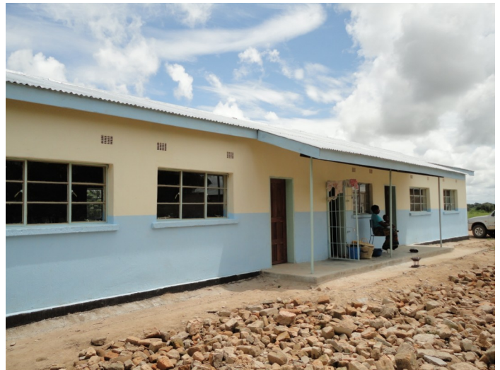
Classroom completed and ready for use!