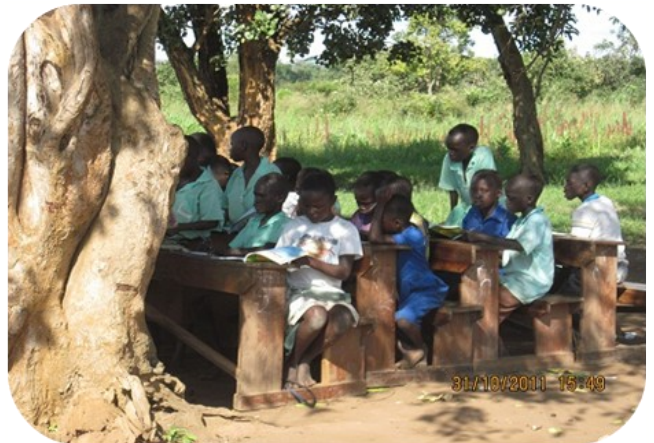
Pupils taught outside at Koch Lila, Uganda

We still have a lot more work to do at Koch Lila, the school urgently needs new toilets, classroom repairs and more teaching materials. However, we are really glad that we are now able to start work on the first phase of these projects.