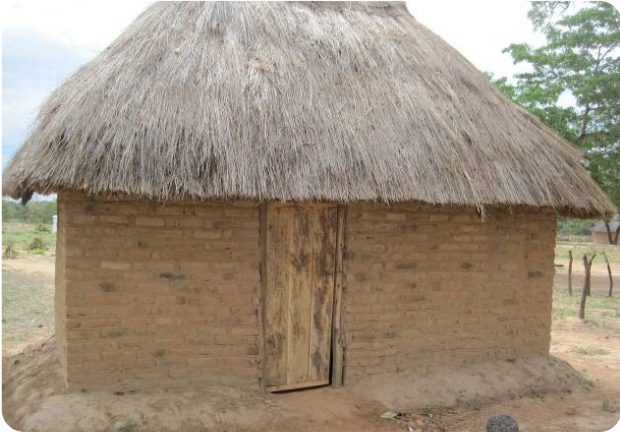
Current staff housing at Muumba

Muumba Community School lies 36km from the town of Kalomo in Zambia's Southern Province. It is a poor, rural primary school, staffed by just three young, un-trained community teachers, yet the school was attended by 150 pupils in 2011.