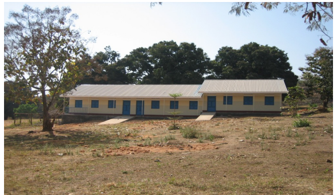
New classroom block ready to use

In January this year we were delighted to finish building a new classroom block at this rural school in South Sudan. Longamere teaches over 340 children but with only three proper classrooms, resulting in children being taught outside or in thatched huts, with no walls or desks. In rainy weather children simply could not be taught and were sent home. Thanks to our supporters this new triple classroom block was completed in January 2012.